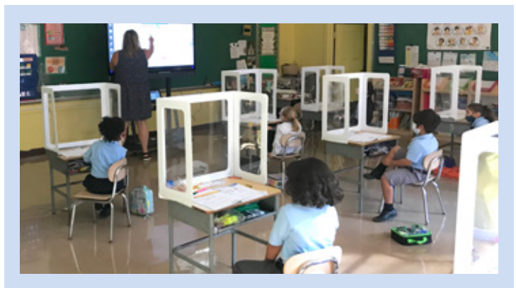
The first grade is ready for a great year of learning!