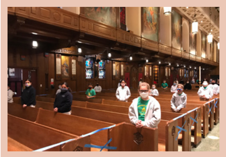
Mass looks a little different this year, but the 5th grade is happy to be back in church with their classmates.