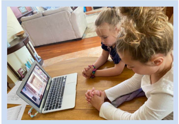
Students attended the mass of the Feast of the Ascension online, which was broadcasted live from St. Andrew Avellino Church.