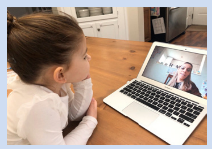
Kitchen tables are the classrooms in Spring 2020!