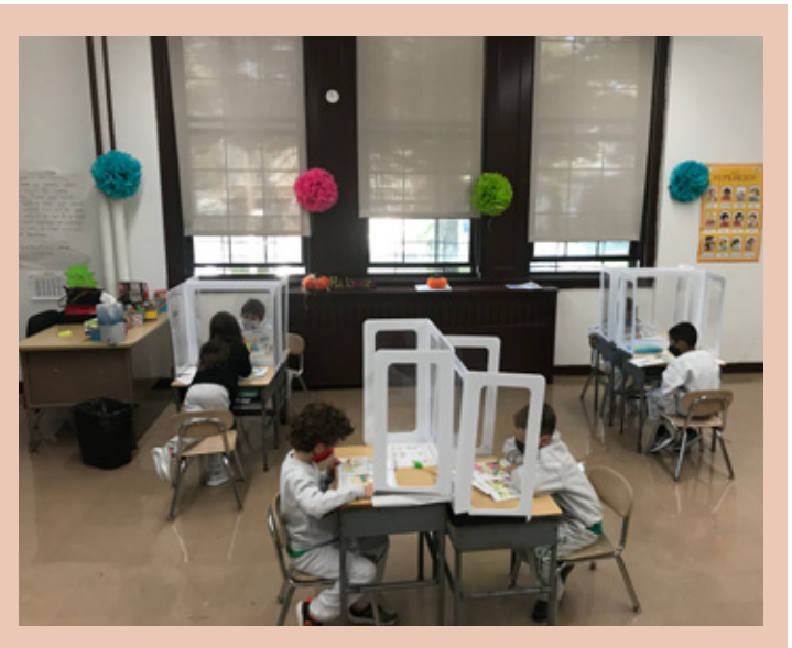
First graders take turns reading the class story to one another.